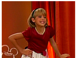
GUYS DRESSED LIKE GIRLS ON CHILDREN'S T.V.